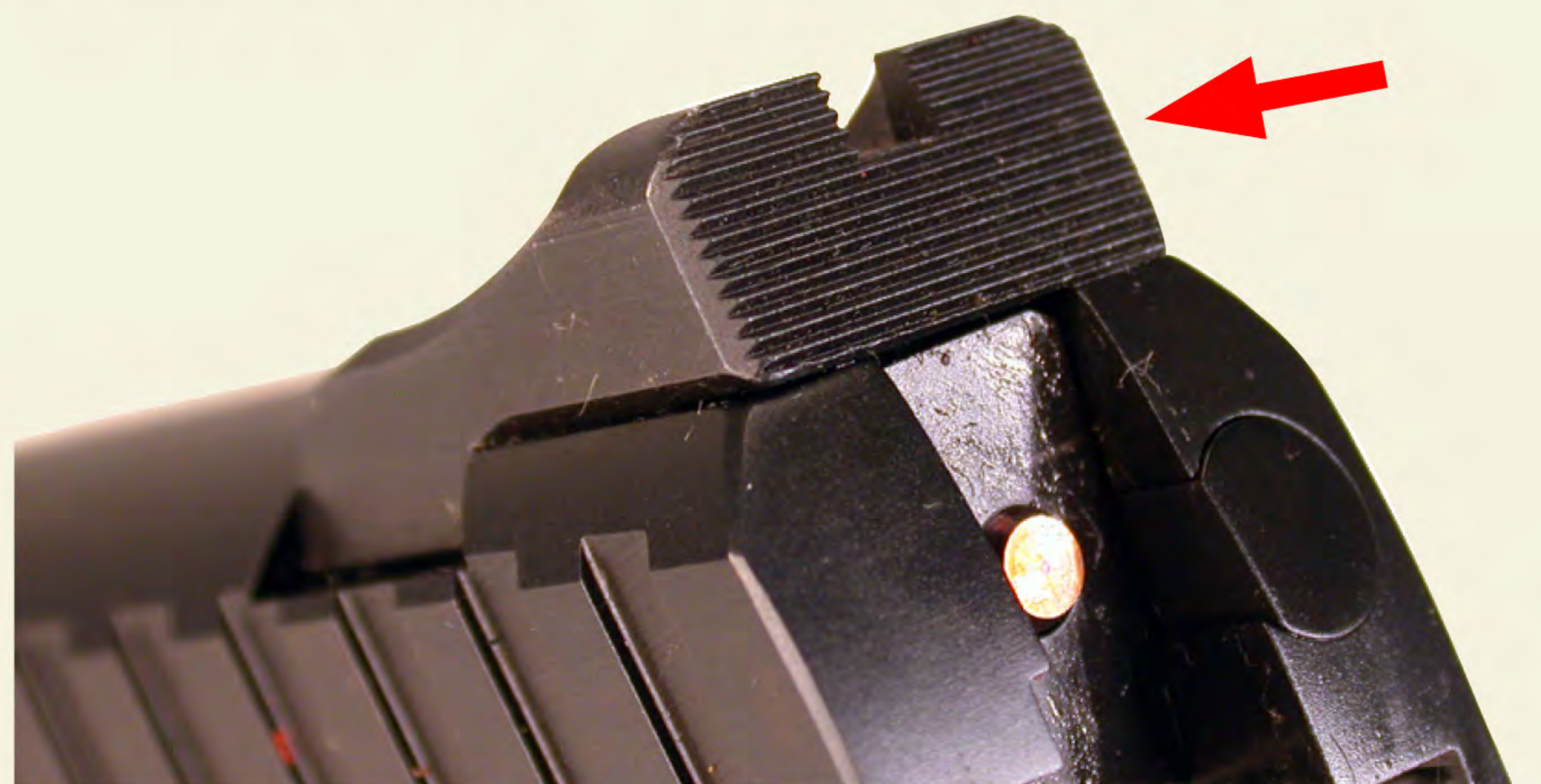
Above: The horizontal lines machined into the Heinie brand sights were very effective in absorbing glare. The sight picture was excellent.