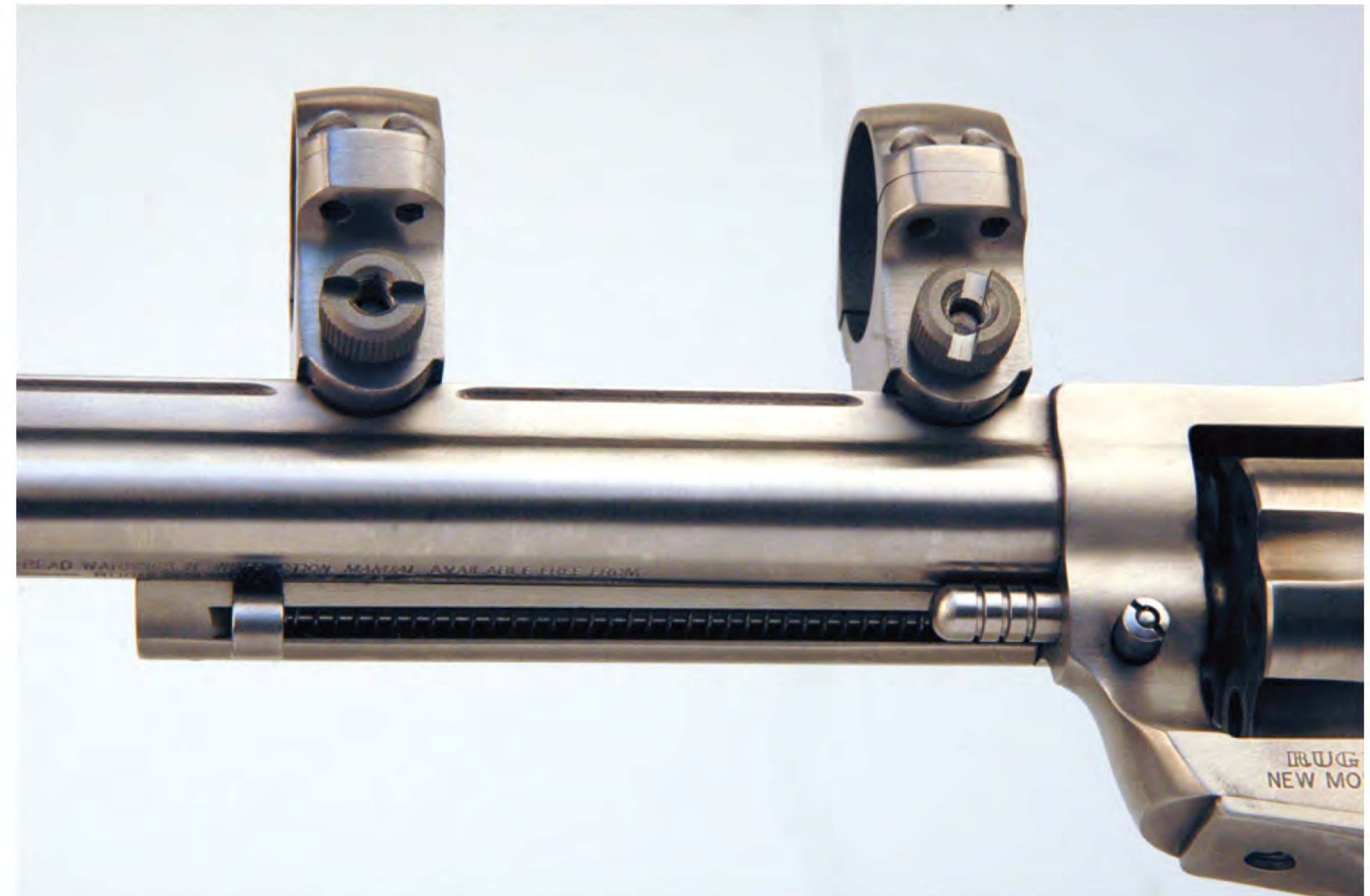
Above: Scope rings and the integral scope mount, which was all but hidden in the cuts of the flat top barrel, were a real bonus. The ejector rod, spring and ejector rod control tab are visible underneath the barrel.