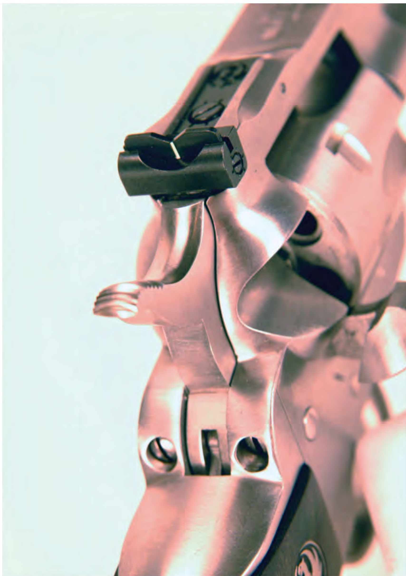
Left: The rear sight sported a V-notch and white vertical line at the center.