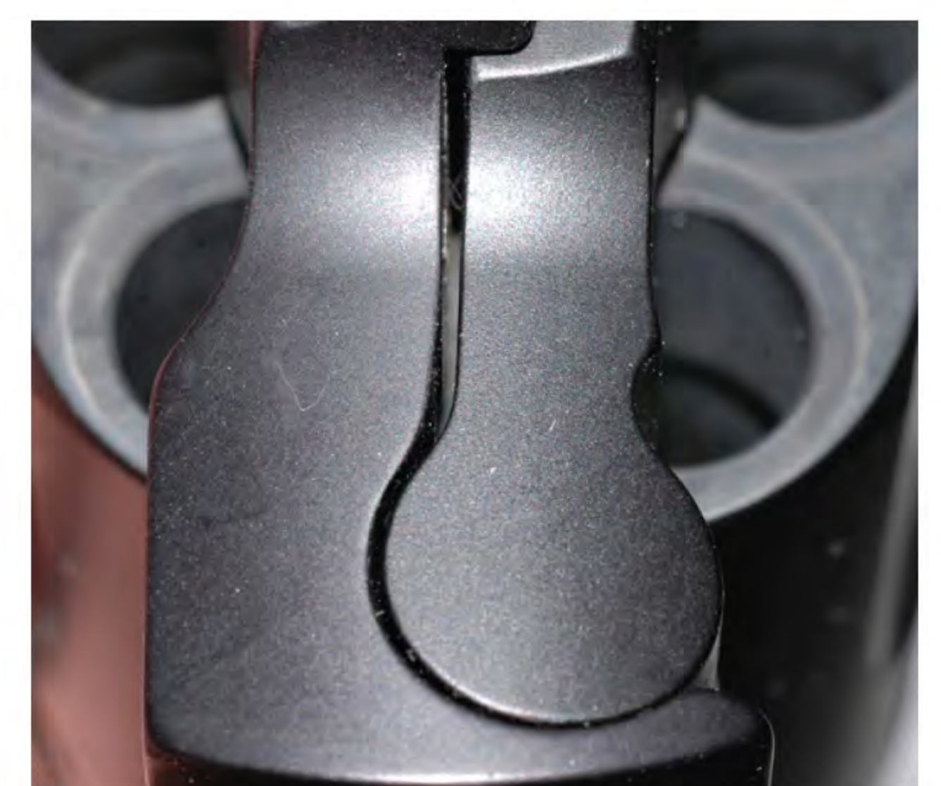
Above: The new Bodyguard, with no front latch, showed huge gape at the front with moderate pressure on the cylinder.