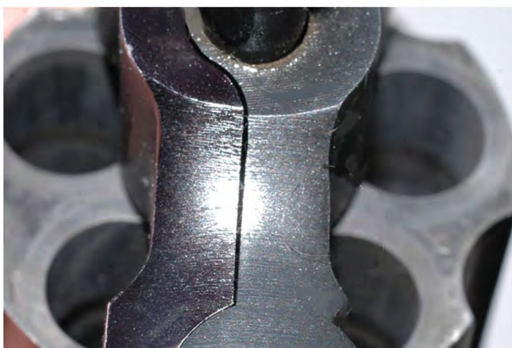
Above: The Centennial was pretty tight at the crane when we pressed the cylinder sideways.

Far Left: The new Bodyguard has a lot more travel to its thin ejector rod, and that helps get the empties out. It has about a quarter-inch more travel. Near Left: Some people don't like the limited amount of ejection provided by the short-stroke rod in the Centennial. However, if you shake the gun as you work the ejector, empties generally clear.