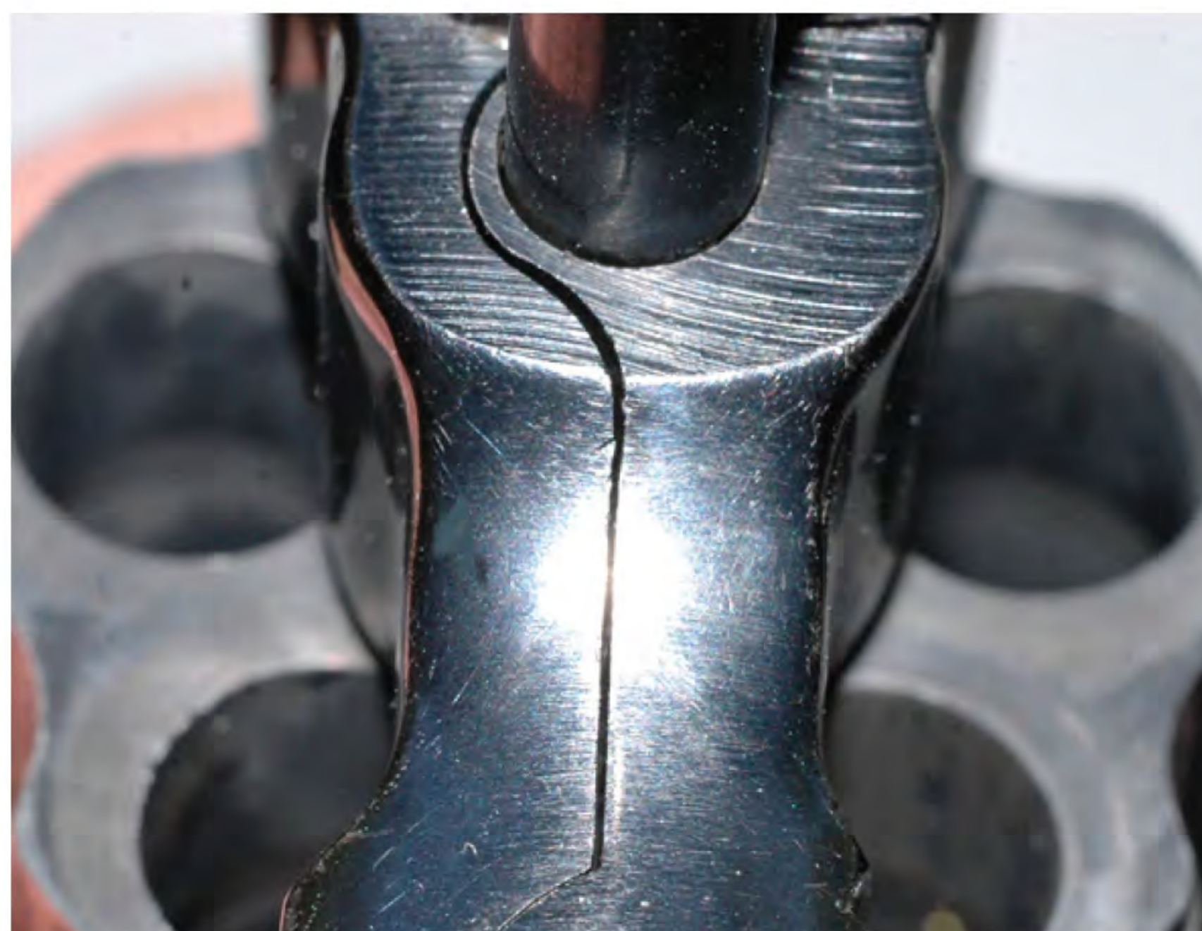
Above: So was the old square-grip Chiefs Special.