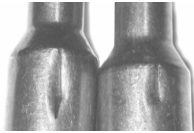
The box magazine of the Dakota held two rounds but would let only one out. The bottom round would jam the rifle and get dented severely in the process, as these two rounds show.