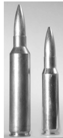
The .300 Dakota (left) has a lot more steam than the .308 at right. Dakota gets all they can out of the space in the big non-belted cartridge.

ed NP3 formula, an off-white electroless nickel finish. The bolt was extremely slick in the action, and anything plated in NP3 will never rust. The bolt lugs appeared to have full contact on their rear surfaces, as did the other two rifles.