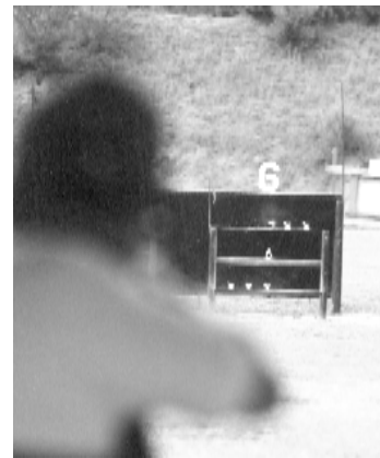
The KFS NS 522 shot RWS R50 very well, as the flying chicken silhouette demonstrates.

Below: A downside—The 522's magazine area makes an uncomfortable platform. The sharp edges of the magazine and the well dig into the supporting hand. Upside: The Allen head screws allow shooters to torque-tune the action for best accuracy.