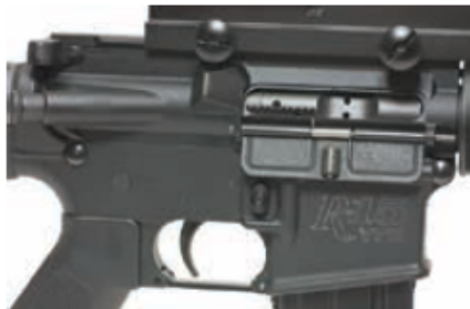
Fit and finish on the rifle were consistently good, save for slight looseness between the upper and lower receivers. The trigger wasn't particularly good with a break weight of 7.6 pounds.