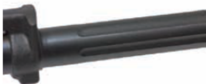
The black-oxide finish was evenly applied on all the metal surfaces, including the flutes in the barrel. The barrel was a medium-contour diameter.