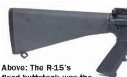
Above: The R-15's fixed buttstock was the standard A2 style.