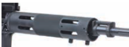
The free-float aluminum handguard was checked for better grip. No problems with it.